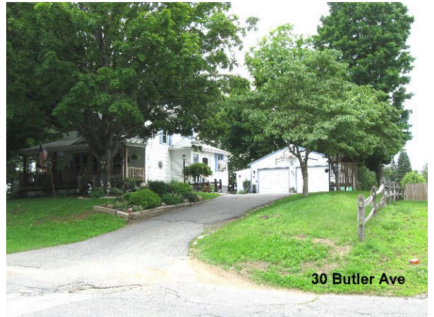
( https://images.vgsi.com/photos2/ChicopeeMAPhotos/\00\00\47\36.JPG )